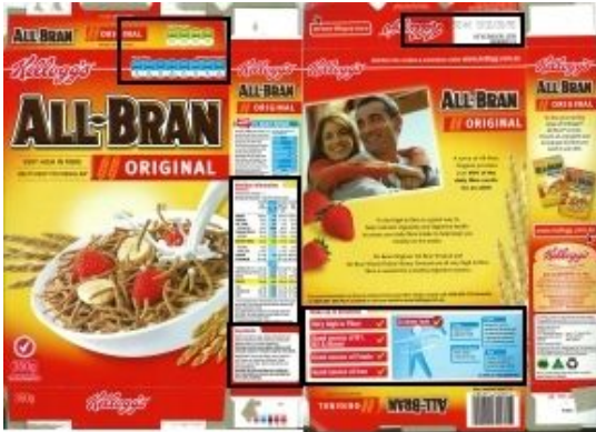
(4.5cm × 10cm)