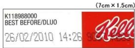
(7cm × 1.5cm)